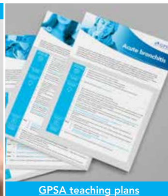
GPSA teaching plans